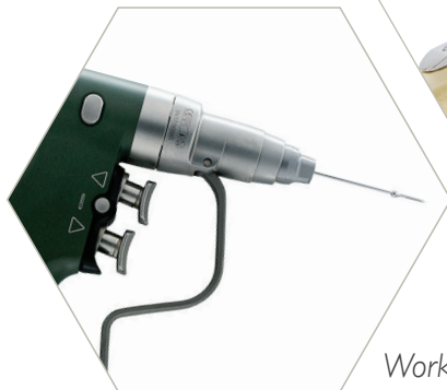
Works with any wire/pin driver

Shown here with the Elite TPLO plate with sliding pin hole!